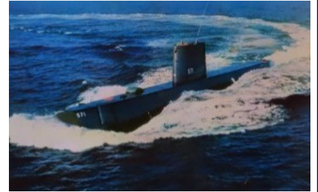
USS Nautilus, straight from Jules Verne

The USS Nautilus was launched in 1954. the world's first operational nuclear-powered submarine and on 3 August 1958 became the first submarine to complete a submerged transit of the North Pole.